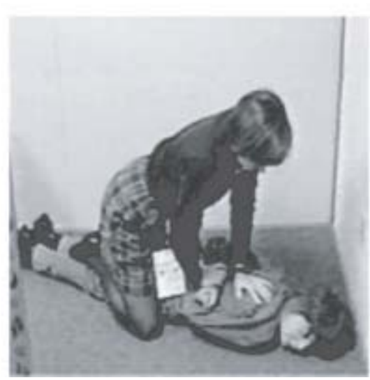
A Parent's Guide to Protecting Your Child From the Use of Restraint, Aversive Interventions, and Seclusion